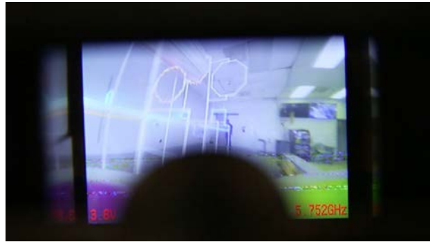
A look through first-person view goggles at Top Dronz.

The store is available for birthday parties, field trips and corporate events. More information can be found here .