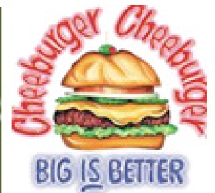
A sampling of restaurants from which CitySpree Dothan delivers.