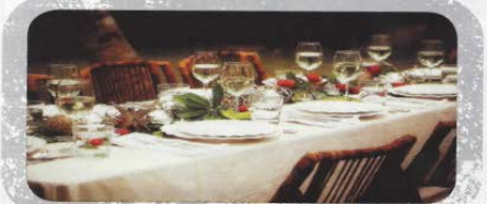
India Hicks Collection Outdoor table set

Orlando Museum of Art, 2416 N. Mills Ave., Orlando; 407.896.4231; omart.org .